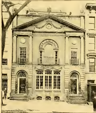
NEW YORK STATE NATIONAL BANK.

the fraternal organizations are exceptionally strong and representative in their membership; there are forty-two social clubs, and as might be expected from the antiquity of the place, there are numerous patriotic-hereditary societies, based on revolutionary and colonial descent.