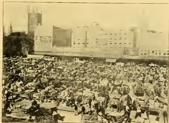
THE PUBLIC MARKET.

acres; the most pretentious of these, Washington Park, is unsurpassed in any city of the approximate size of Albany. In this park are to be seen the statue of Robert Burns, and the King fountain — “Moses smiting the rock.” In connection with the park system, there are ninety-five acres of boulevards under park care. Albany has five excellent hospitals;