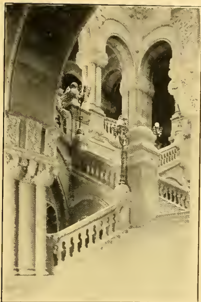
THE CAPITOL—THE GREAT WESTERN STAIRCASE.