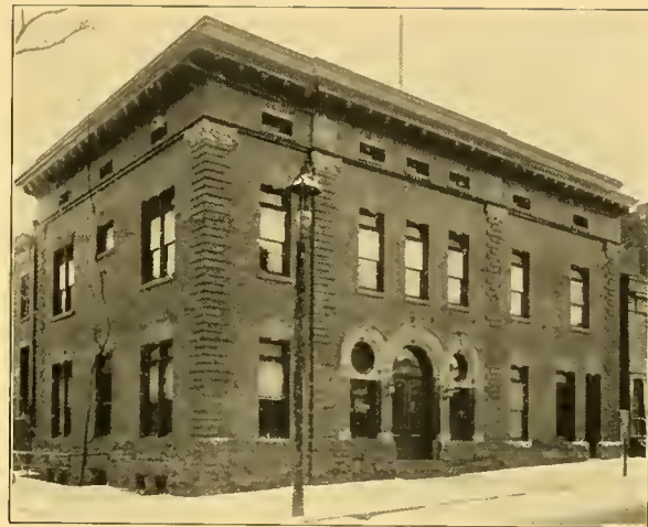
FIRST PRECINCT STATION HOUSE.