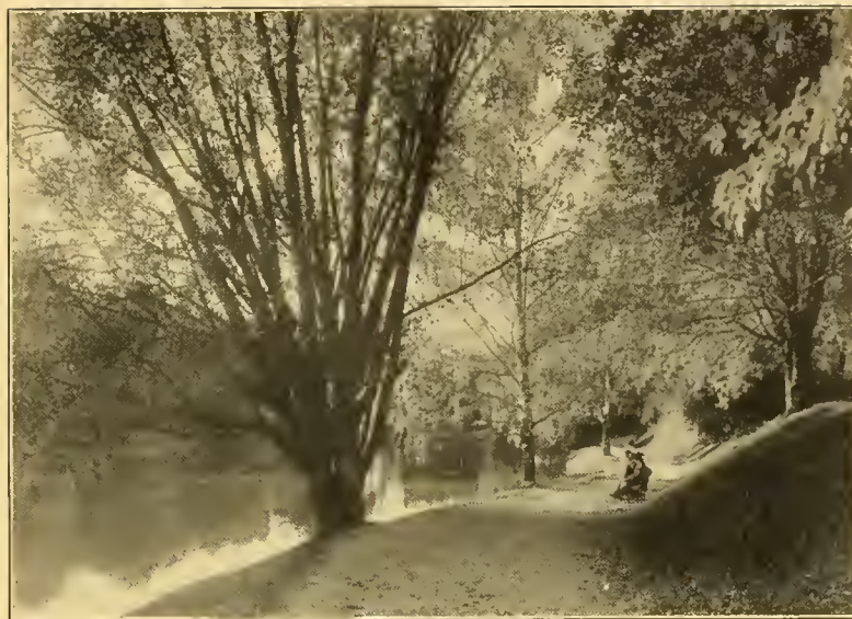
THE LAKE—WASHINGTON PARK.

Depot, a model of attractive and convenient up-to-date railway facilities, might not inaptly be termed the gateway to Albany in the architectural sense, as well.