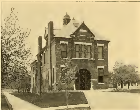
ALBANY FIRE DEPARTMENT — STEAMER HOUSE No. 10