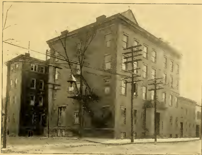
ST. PETER'S HOSPITAL.