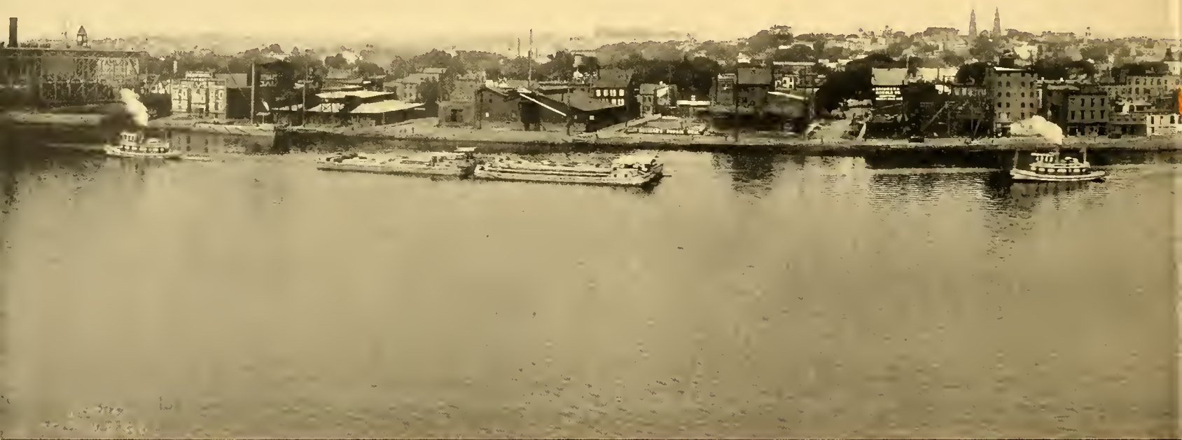
ALBANY AS SEEN FROM