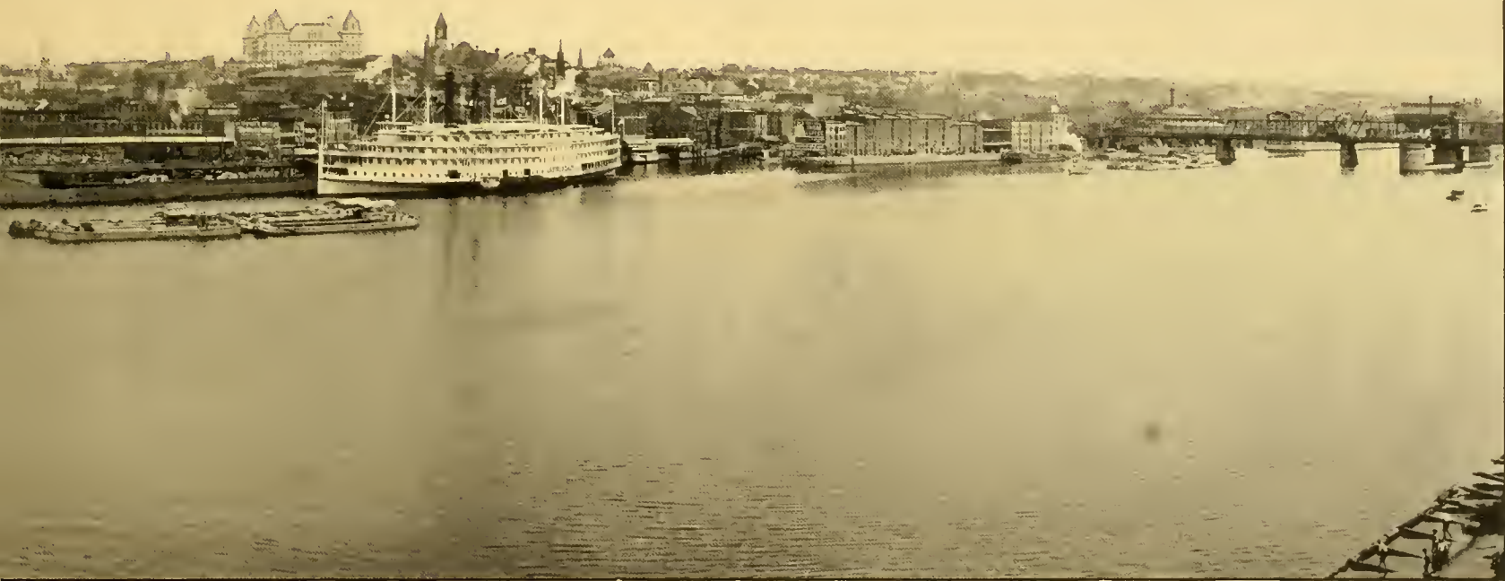
THE HUDSON RIVER.