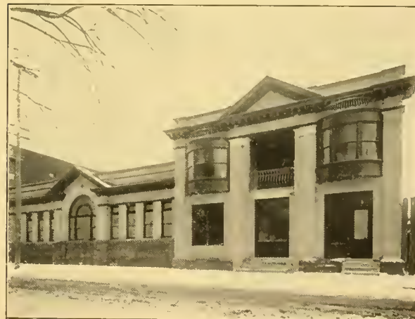
PUBLIC BATH No. 2.