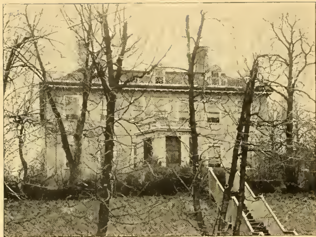
THE SCHUYLER MANSION — ERECTED IN 1760-61.