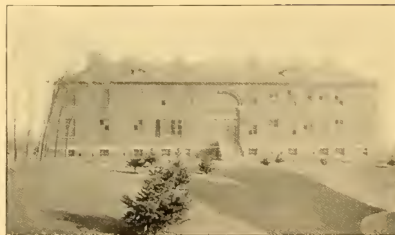
THE CONTAGIOUS DISEASE HOSPITAL.