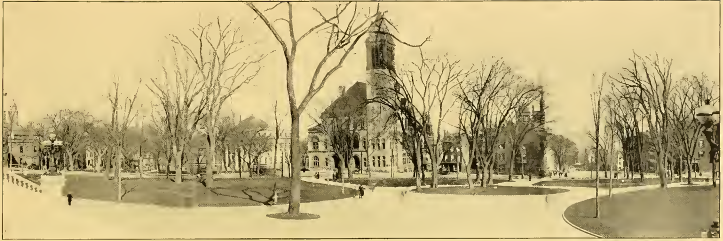
LOOKING EAST FROM THE CAPITOL STEPS.