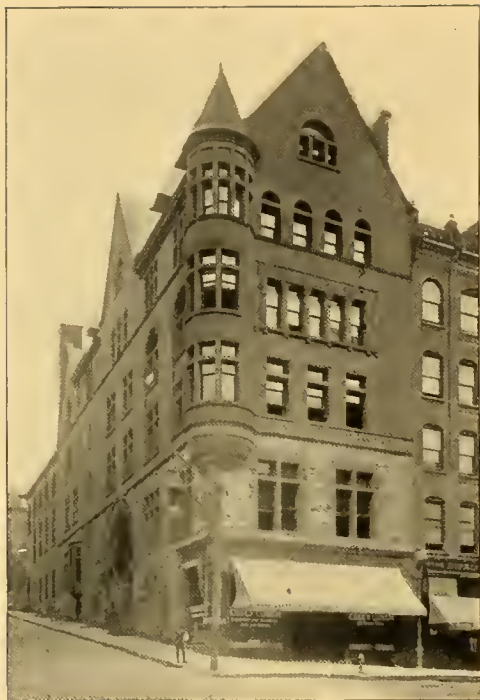
THE CENTRAL YOUNG MEN'S CHRISTIAN ASSOCIATION.