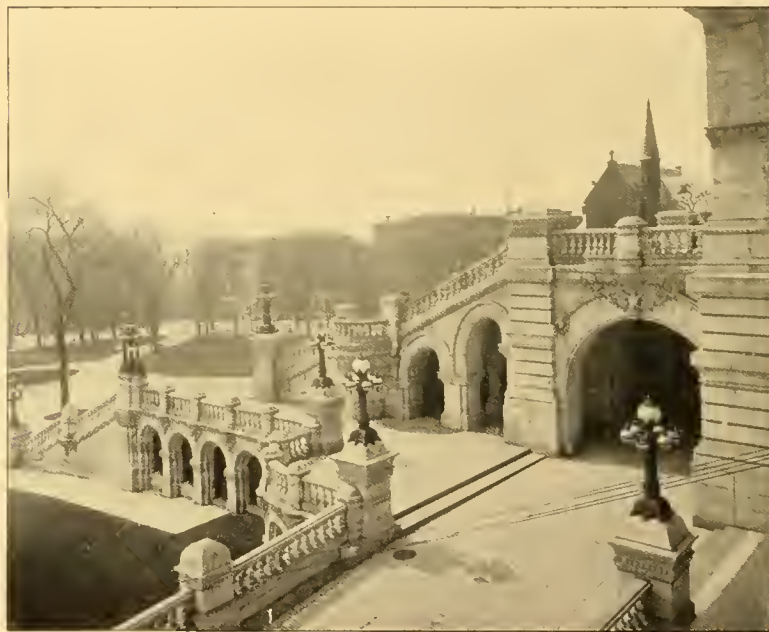
THE CAPITOL—EASTERN APPROACH.