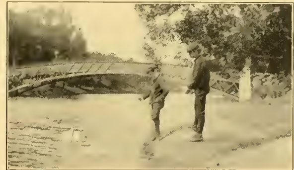
WASHINGTON PARK—LAKE AND BRIDGE.