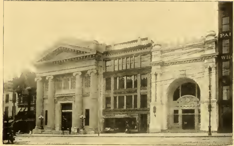
SOME STATE STREET BANKS.

Original building erected 1803. The oldest building in the United States used continuously for banking purposes.