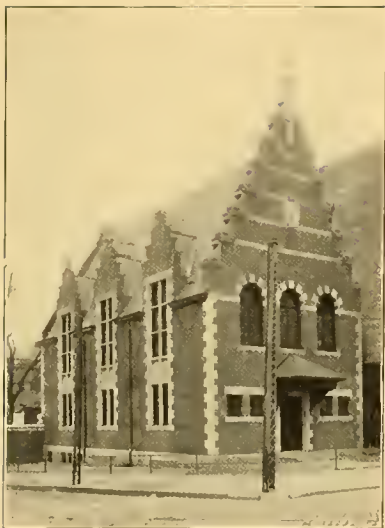
THE PRUYN LIBRARY.