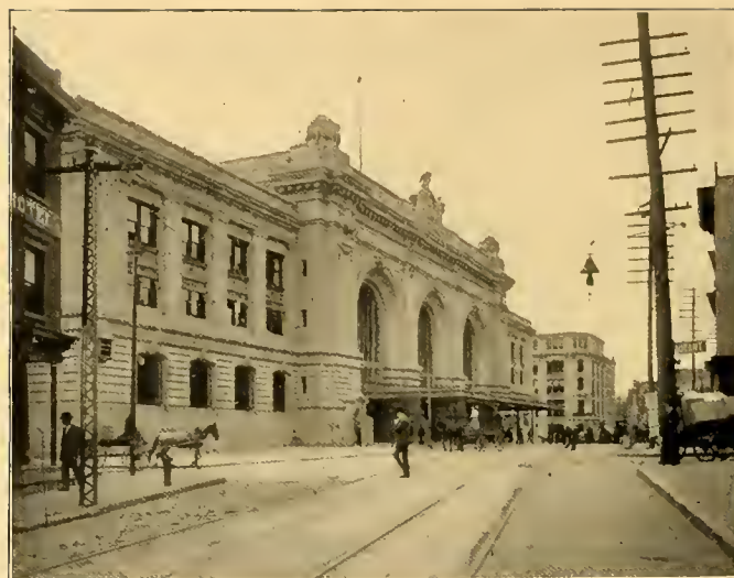
THE RAILROAD STATION.

in the councils alike of State and Nation, as well as to bear the sword in defense of our institutions. The very soil here is reminiscent of great and valiant deeds; so that it might well be said, in the words of Holy Writ: "Put off thy shoes from off thy feet; for the place whereon thou standest is holy ground."