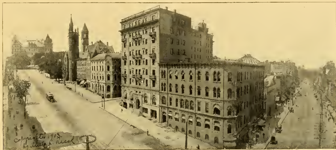
LOOKING UP STATE AND PEARL STREETS.