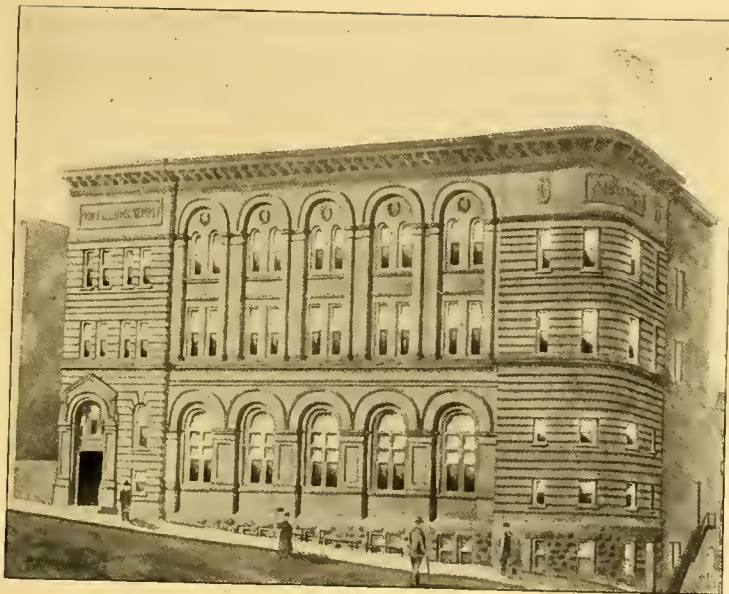
ODD FELLOWS TEMPLE.