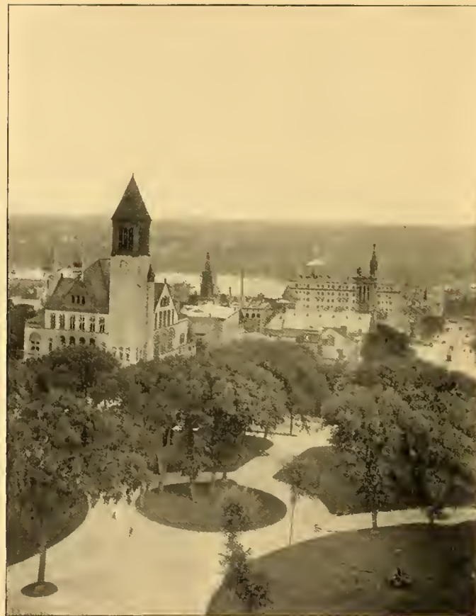
A VIEW FROM THE CAPITOL.