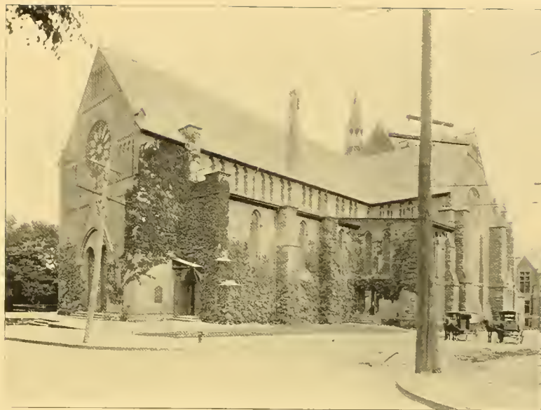
CATHEDRAL OF ALL SAINTS.

of Dominie Megapolensis, able and devout men of scholarship and reputation occupy the pulpits. Albany has four daily newspapers, of which some have a national reputation. The city is supplied with an abundance of pure drinking water from a large filtration plant. There are over eighty-seven miles of paved streets and nearly a hundred miles of sewers. There are seventeen parks, comprising over three hundred and six