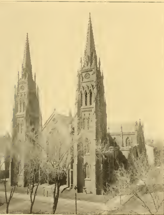
CATHEDRAL OF THE IMMACULATE CONCEPTION.