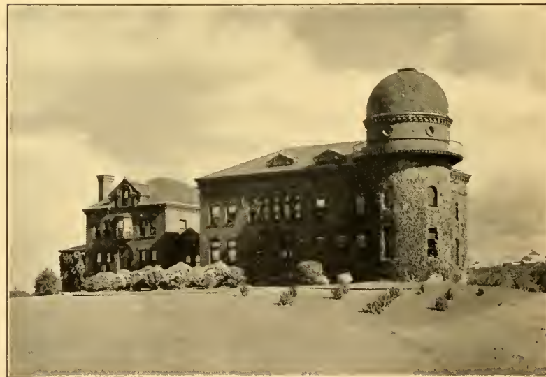
THE DUDLEY OBSERVATORY

the architectural style of the City Hall is admirable for its simple classic beauty. To these and other public buildings will soon be added a long-needed State Educational Library building, attractive in design and thoroughly adapted to its purposes. The many new semi-public buildings, banking offices, private residences and modern apartment houses, have so transformed the ancient city in which Dutch traditions lingered even a decade ago, that the metamorphosis is little less than startling. The "entrance gate"—the new Union