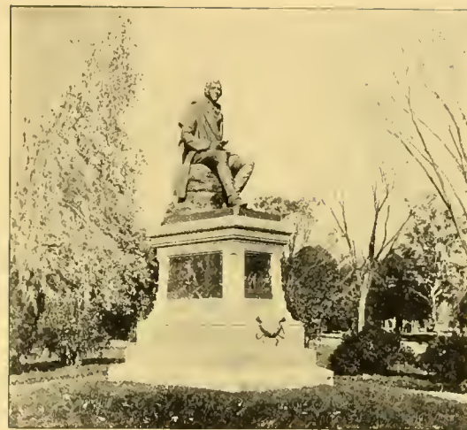
WASHINGTON PARK—THE BURNS STATUE.