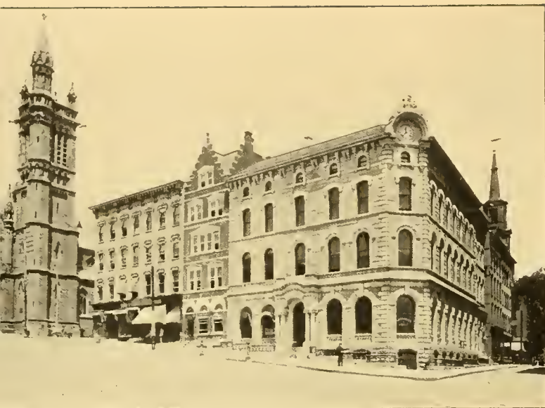
ALBANY COUNTY COURT BUILDING.