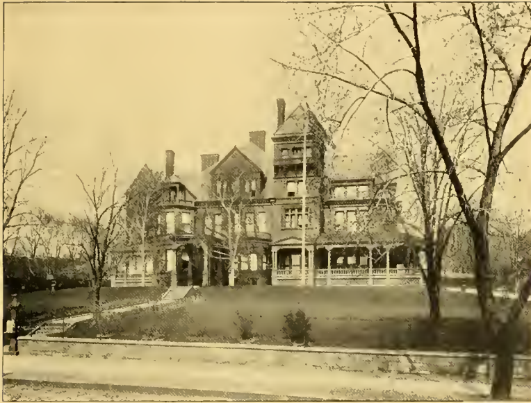
THE EXECUTIVE MANSION.