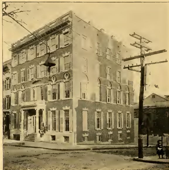
THE YOUNG WOMEN'S CHRISTIAN ASSOCIATION.