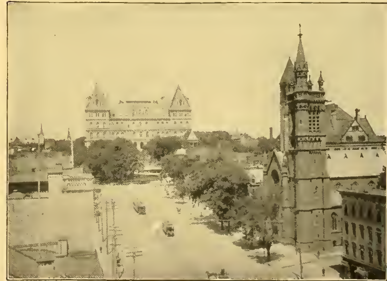
LOOKING UP STATE STREET.

Albany is the oldest settled city in the United States; was organized in 1686, and has been the Capital of New York State since 1797. In peace and in war, in sunshine and in storm, this ancient city has made history, taking part in the greatest events, from times pre-revolutionary, and giving her distinguished sons to high places