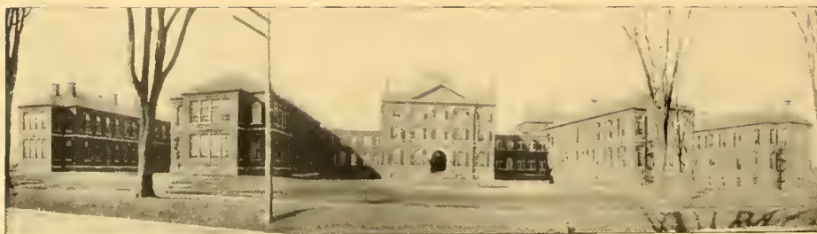
THE ALBANY HOSPITAL