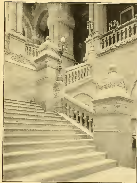
THE CAPITOL—THE GREAT WESTERN STAIRCASE.