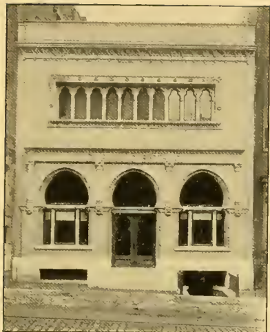
PUBLIC BATH No. 1.