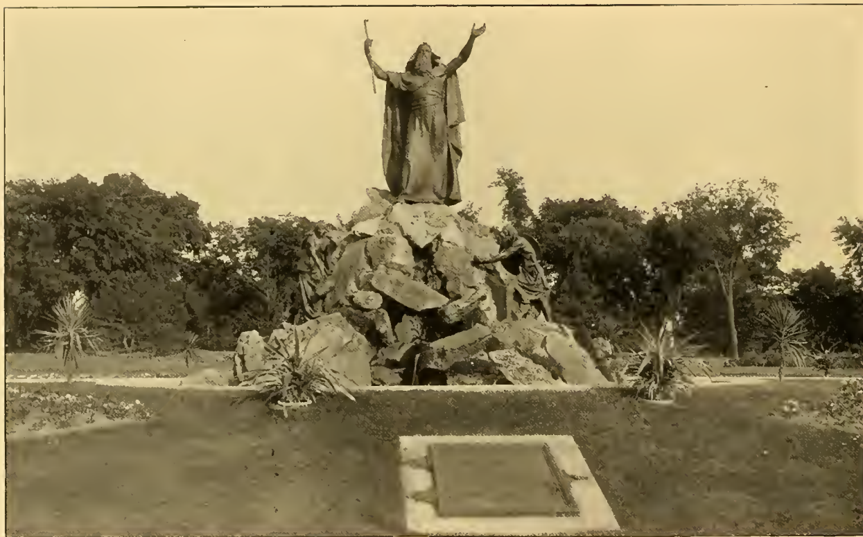
THE KING FOUNTAIN—MOSES SMITING THE ROCK.—WASHINGTON PARK.