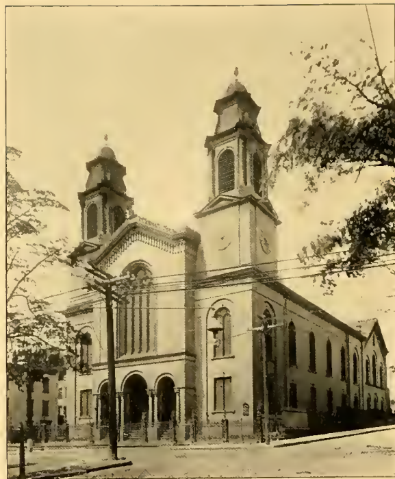
FIRST REFORMED CHURCH — ERECTED IN 1790.