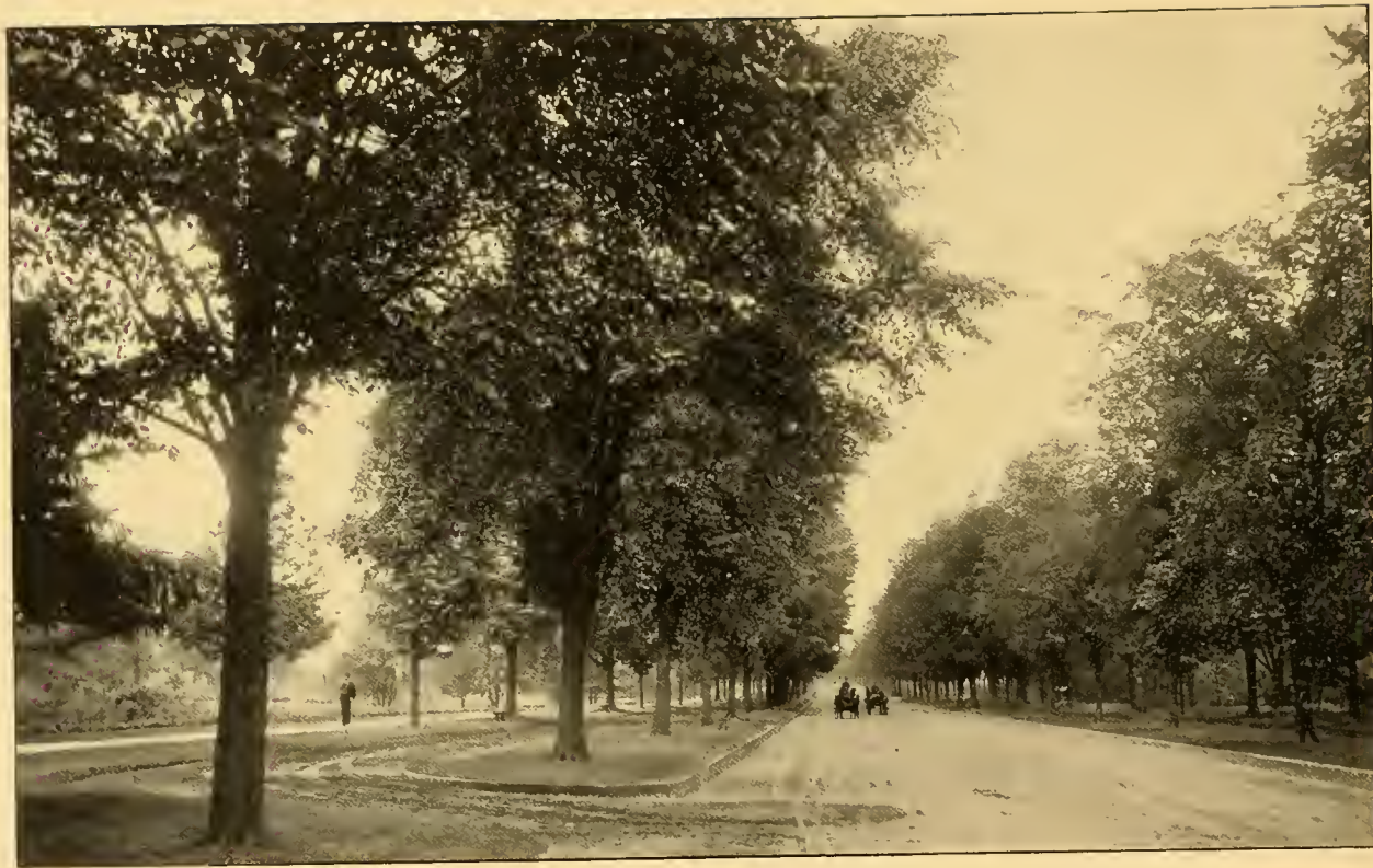
THE MANNING BOULEVARD.