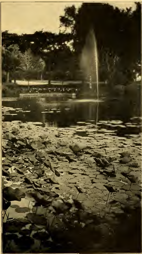
THE LOTUS BEDS—WASHINGTON PARK.