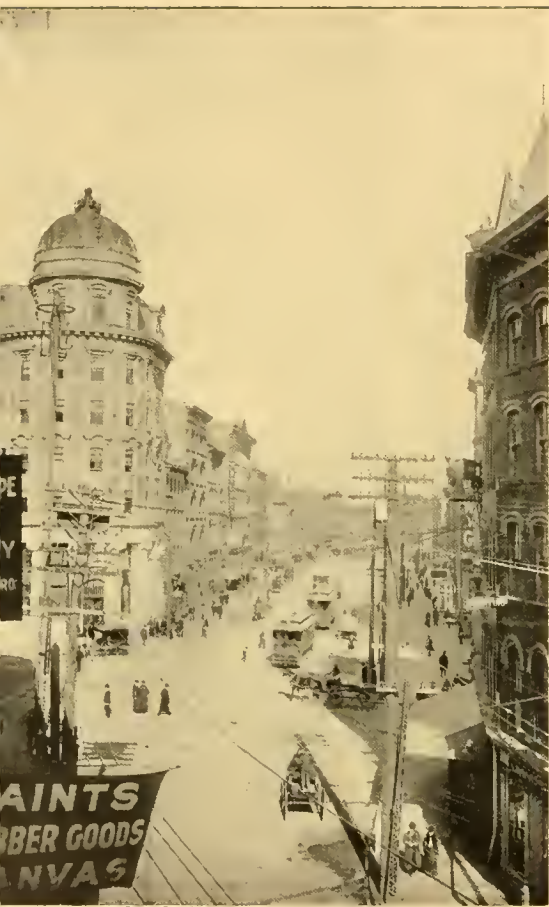
LOOKING UP BROADWAY FROM STATE STREET.