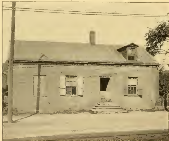
ERECTED IN 1666.