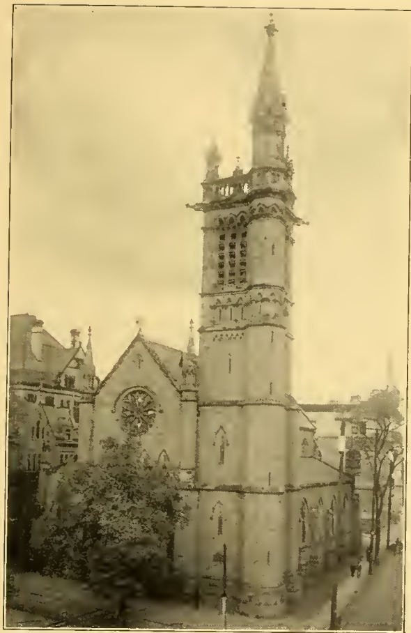
ST. PETER'S CHURCH.