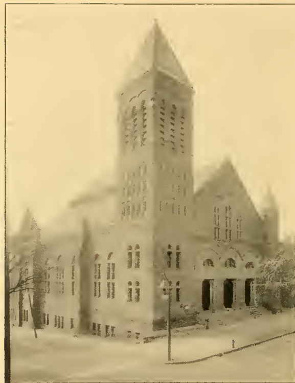
TEMPLE BETH JEMETH.