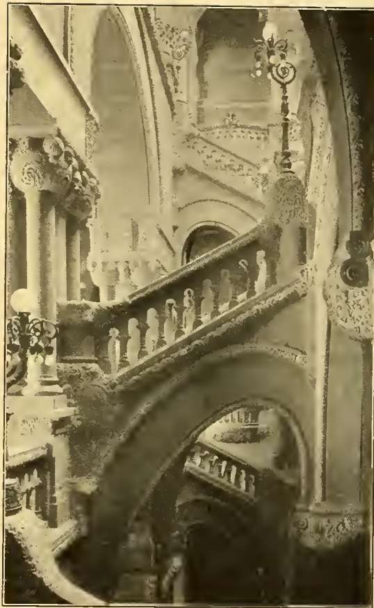
THE CAPITOL—THE GREAT WESTERN STAIRCASE.