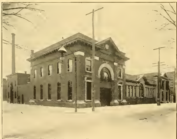
ALBANY FIRE DEPARTMENT — STEAMER HOUSE No. 5.