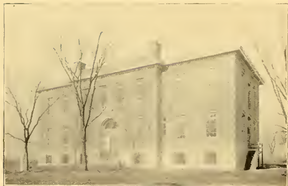
THE SMALLPOX HOSPITAL.